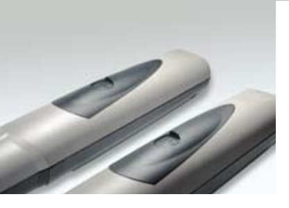
A design to serve technology. Came innovation has designed an excellent versatile bearing structure. The two stems in the versions up to 3 and 7 m per leaf, engage smoothly into a single semishell structure.

The gearmotor has bearing semi-shells in die-cast aluminium of excellent quality and silent running. Axo is equipped with adjustable mechanical stop to memorize the gate run. Available also in the 24V version with the simplified connection system with only one single three-wired cable and with the innovative 230V technology, which gives very efficient and simple control of slowing down movements.