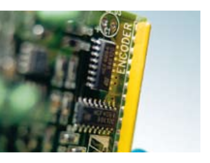
Encoder management. The slow-down speed of the 230V A.C. gearmotor is also controlled by encoder technology which keeps the generated force under control as well.